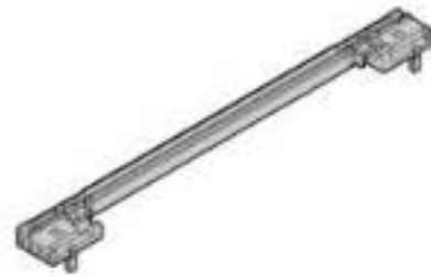
Optional ESD clip for alignment pin