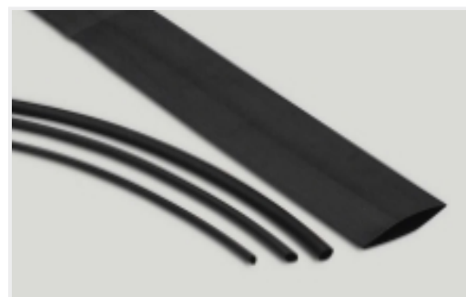
Single Wall Tubing(86)