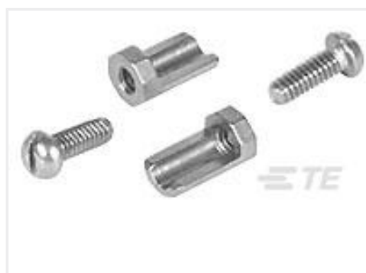
TE Part #530341-3 BOX RECPT KIT