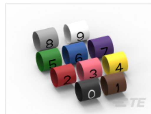
TE Part #5059070007 TRSA-1014/C/1/3