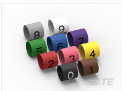
TE Part #CAT-HST-TRSA TRSA Heat Shrink Tubing