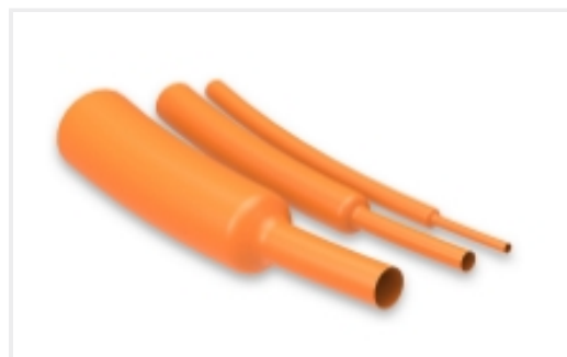
Orange Heat Shrink Tubing(6)