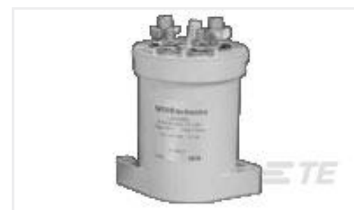
TE Part #4-1618388-6 LEV200A5NAA=RELAY, SPST-NO