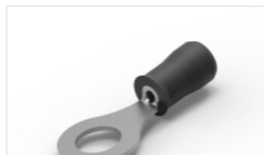
TE Part #CAT-P592-R472A PIDG Ring Tongue Terminals