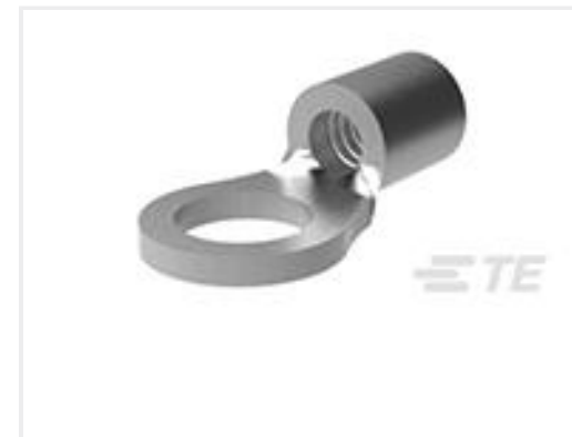
TE Part #8-33457-1 TERMINAL,SOLIS R 12-10 10