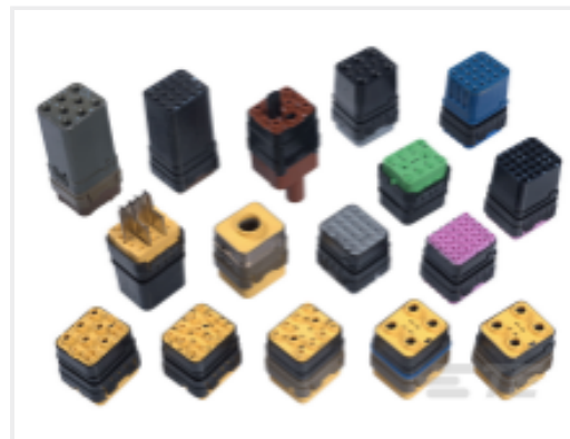
TE Part #ZPF000000000015306 DMC-M 20-22 PN