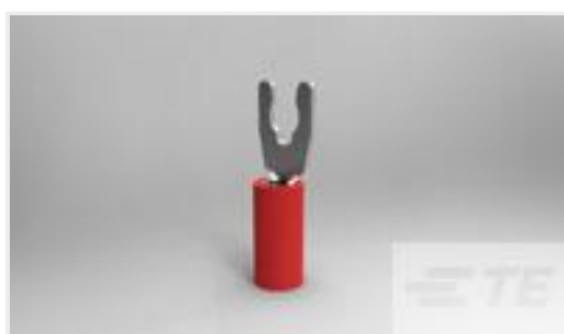
TE Part #8-52929-1 PIDG SP SPD 22-16COMM22-18MIL6