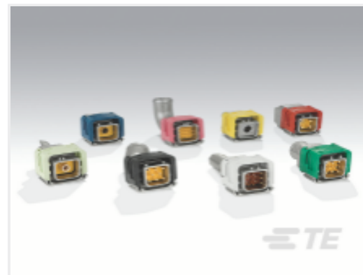
TE Part #ZPF000000000100828 DMC-MD 20 A