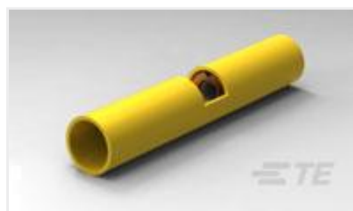
TE Part #320570 SPLICE BUTT PIDG 12-10