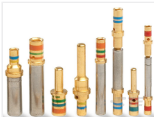
TE Part #38941-22L CONTACTS