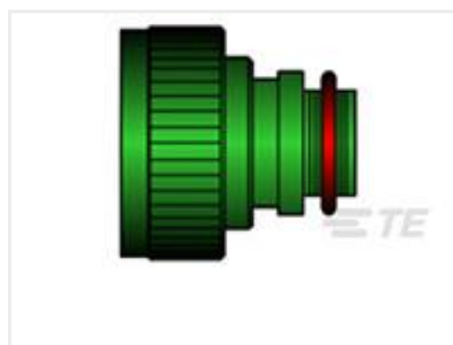
TE Part #362815-000 TXR40AB00-2004AI