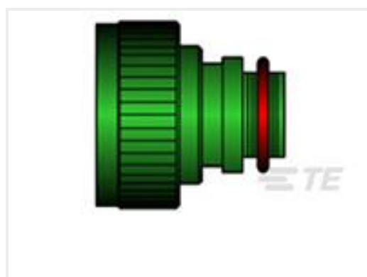
TE Part #324124-000 TXR54AC00-6116AI