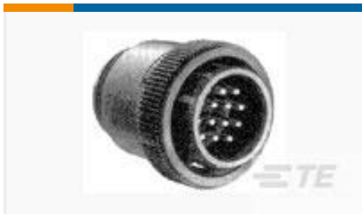
TE Part #206429-1 CPC PLUG ASSY, 11-4, REV SEX