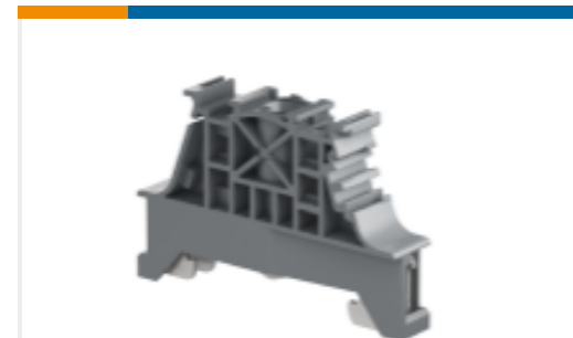
TE Part #1SNK900001R0000 BAM4