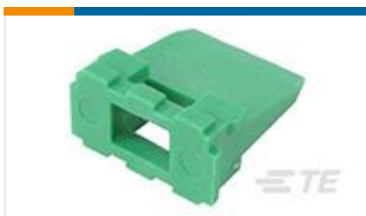
TE Part #W6P WEDGE LOCK, 6P, REC, GRN, DT