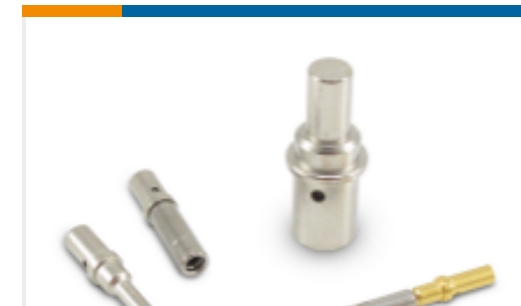
TE Part #0462-201-20141 DEUTSCH SOLID CONTACTS