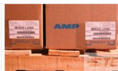
TE Part # C78108-000 EP-318064-10-9