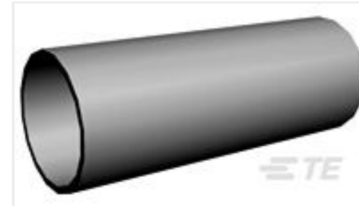
TE Part #4-745130-2 SHLDING FERRULE,PLTD,BULK PKG