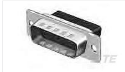
TE Part #207464-2 CRIMP SNAP PLUG ASSY,SZ 3