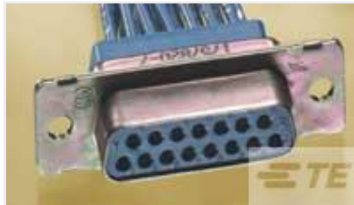
TE Part #207463-1 CRIMP SNAP RCPT ASSY,SZ 3