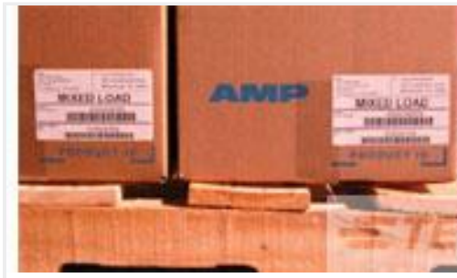
TE Part # E31556-000 EP-381127-5-9