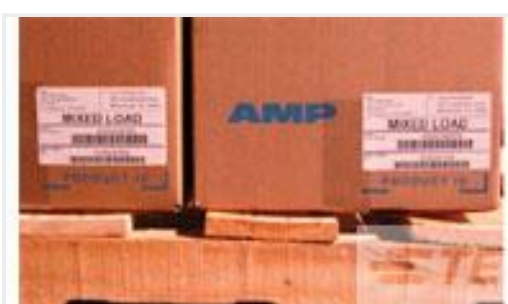
TE Part # A77099-000 EP-101635-2.5-9