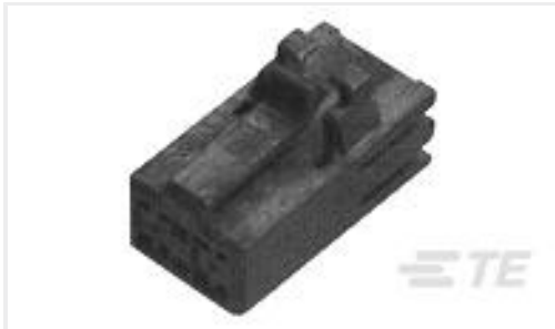
TE Part #8-487937-0 080 HOUSING FFC 50CL DR LATCH