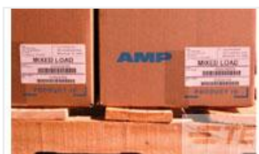
TE Part # A31113-000 EP-095095-10-9