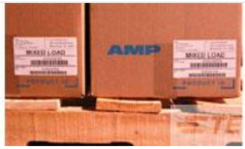
TE Part # D34022-000 EP-254127-10-9