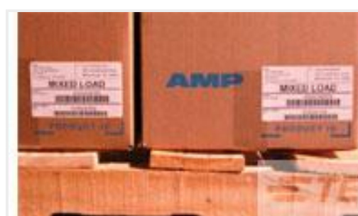
TE Part # F84258-000 EP-191064-10-9