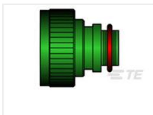
TE Part #EB9468-000 TXR40AZ00-1612AI