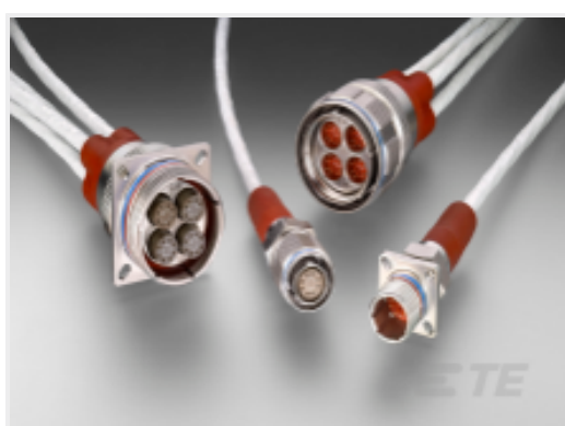
TE Part #YCFX26T2532JZN-1A0 PLUG ASSY