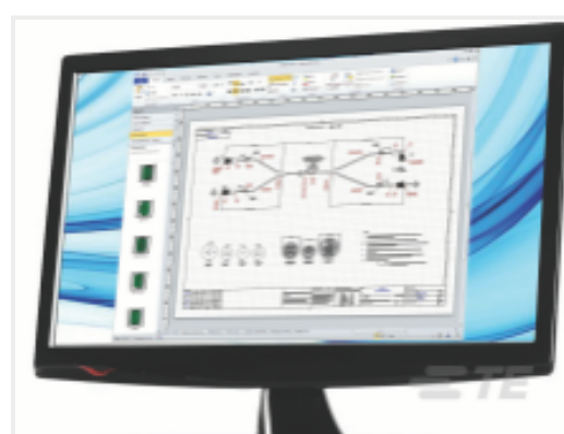
TE Part # 9-120035-6 HarnWare/HarnVis Renewal Charge