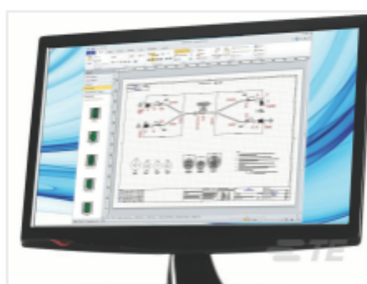
TE Part # 9-120035-5 HarnWare/HarnVis Purchase Charge