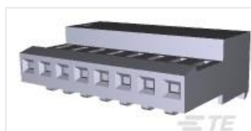
TE Part #3-640441-8 08P MTA100 CONN ASSY WHT