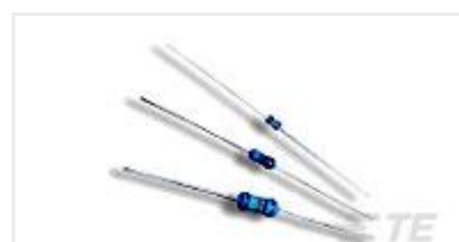
TE Part #2-1676913-6 YR1 0.1% 1K0