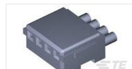
TE Part #2058943-3 Cable Assembly Mini CT 4 pos.