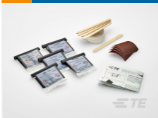
TE Part #583393-000 S1125-KIT-5