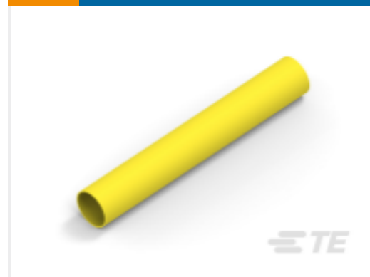
TE Part #NB18254001 RNF-100-2-YO-SP