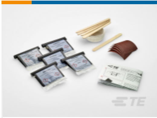
TE Part #878462-000 S1125-KIT-1