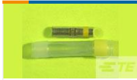
TE Part #650127-000 D-436-83