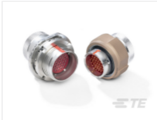
TE Part #ZPF0000000000004583 901-20 B 19