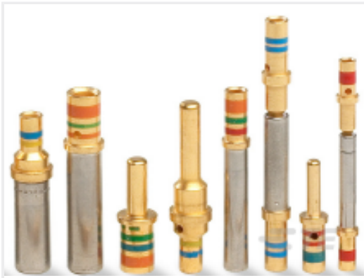
TE Part #ZPF0000000000000807 047-1024-20