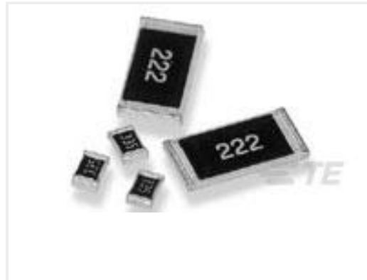
TE Part #1623131-1 CRG0805 1% 1K0