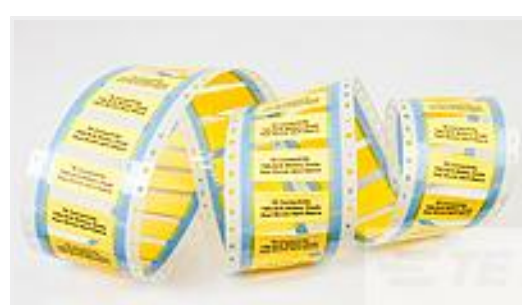
TE Part #4397130001 TMS-SCE-1-2.0-9