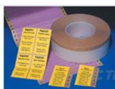
TE Part #583910-000 NPVF050YW-100