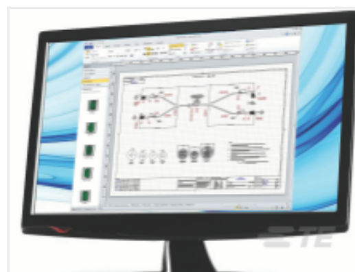
TE Part # 9-120035-6 HarnWare/HarnVis Renewal Charge