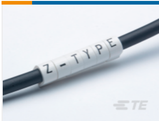
TE Part #EC0018-000 Z-Type Push-On Markers