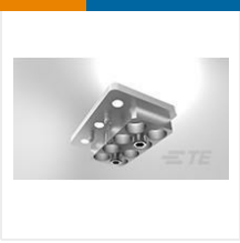
RF BACKPLANE MODULE 8 POS 2157553-1