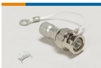
Coax Terminators (16)