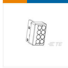
8 Pos RF Mod, DaughterCard, SMPM, VITA67.2 1996705-4