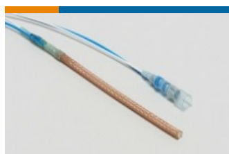
Coax Cable Termination (41)