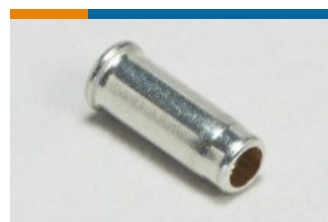
Discrete Sockets (2)