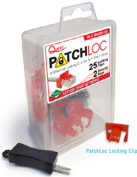
PatchLoc Locking Clip