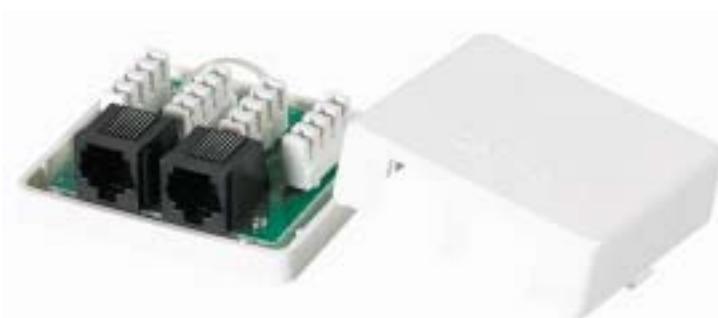
DUAL KRONE CAT5e

QUEST offers a variety of surface mount boxes with integral CAT5e jacks for installations where cost-effective surface terminations are required. The boxes are offered in single and dual outlet versions complete with CAT5e jacks. The jacks feature PC board construction, meet TIA/EIA 568-A requirements and are configured for 568A and 568B wiring standards. Terminations include 110 and Krone and are packaged complete with mounting screws and double-sided adhesive tape.