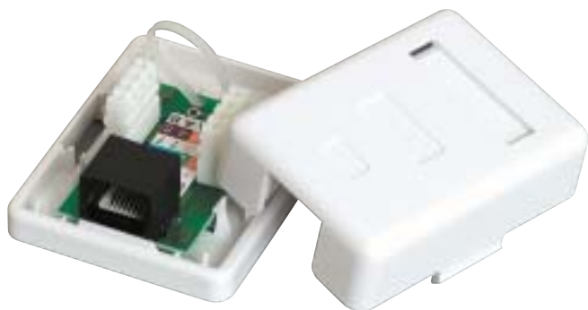
SINGLE 110 CAT5e