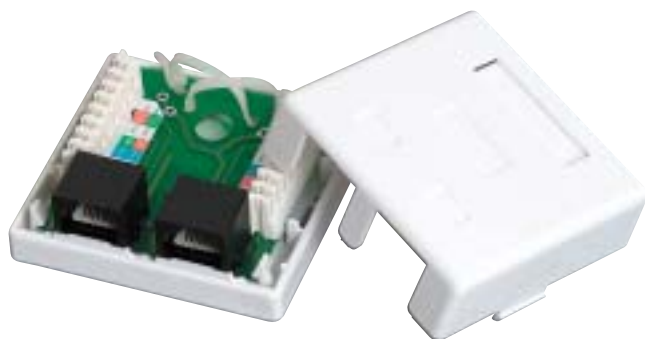
DUAL 110 CAT5e