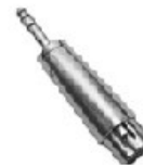
3 Pin XLR To 1/4" Phono Adaptors