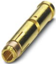
Crimp contact, turned, Contact diameter: 2 mm, Crimp range: 0.25 mm 2 ...1 mm 2

Please be informed that the data shown in this PDF Document is generated from our Online Catalog. Please find the complete data in the user's documentation. Our General Terms of Use for Downloads are valid ( http://phoenixcontact.com/download )