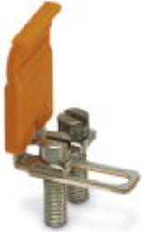
Switching jumper, Number of positions: 2, Color: silver

Please be informed that the data shown in this PDF Document is generated from our Online Catalog. Please find the complete data in the user's documentation. Our General Terms of Use for Downloads are valid ( http://phoenixcontact.com/download )