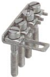
Switching jumper, Number of positions: 4, Color: silver

Please be informed that the data shown in this PDF Document is generated from our Online Catalog. Please find the complete data in the user's documentation. Our General Terms of Use for Downloads are valid ( http://download.phoenixcontact.com )