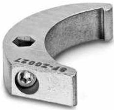
Hook wrench, series: RC

https://www.phoenixcontact.com/pc/products/1607455