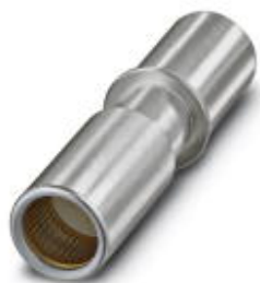
Crimp contact, turned, contact diameter: 10 mm, crimp range: 35 mm 2 ... 35 mm 2

Please be informed that the data shown in this PDF Document is generated from our Online Catalog. Please find the complete data in the user's documentation. Our General Terms of Use for Downloads are valid ( http://phoenixcontact.com/download )