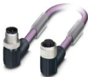
Sensor/actuator cable, 5-position, PUR, violet RAL 4001, Plug angled M12, on Socket angled M12, cable length: 2 m

Please be informed that the data shown in this PDF Document is generated from our Online Catalog. Please find the complete data in the user's documentation. Our General Terms of Use for Downloads are valid ( http://phoenixcontact.com/download )