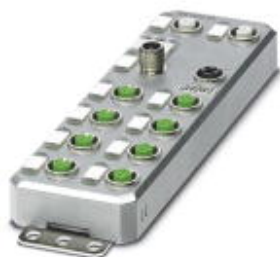
Axioline E-PROFINET device in a metal housing with 8 digital inputs and 4 digital outputs, each with a load capacity of 2 A, 24 V DC, M12 fast connection technology

Please be informed that the data shown in this PDF Document is generated from our Online Catalog. Please find the complete data in the user's documentation. Our General Terms of Use for Downloads are valid ( http://phoenixcontact.com/download )