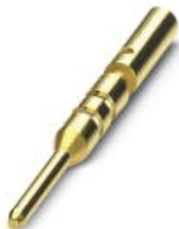
Crimp contact, turned, Contact diameter: 0.8 mm, Crimp range: 0.08 mm²...0.25 mm²

Please be informed that the data shown in this PDF Document is generated from our Online Catalog. Please find the complete data in the user's documentation. Our General Terms of Use for Downloads are valid ( http://phoenixcontact.com/download )