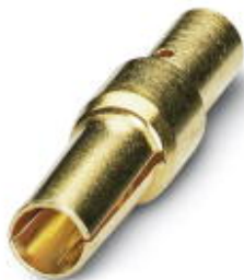
Crimp contact, turned, Contact diameter: 2 mm, Crimp range: 1.5 mm 2 ...2.5 mm 2

Please be informed that the data shown in this PDF Document is generated from our Online Catalog. Please find the complete data in the user's documentation. Our General Terms of Use for Downloads are valid ( http://phoenixcontact.com/download )