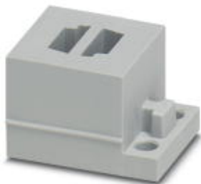
Small, slotted cable sleeves suitable for two AS-i cables (R-R), material: SEBS, version: right, right

Please be informed that the data shown in this PDF Document is generated from our Online Catalog. Please find the complete data in the user's documentation. Our General Terms of Use for Downloads are valid ( http://phoenixcontact.com/download )