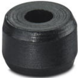
Fixing rings, for presetting the processing tools

Please be informed that the data shown in this PDF Document is generated from our Online Catalog. Please find the complete data in the user's documentation. Our General Terms of Use for Downloads are valid ( http://phoenixcontact.com/download )