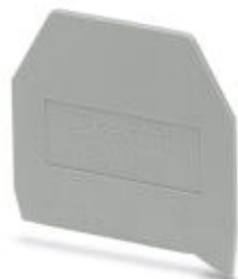
End cover, Length: 43 mm, Width: 1.5 mm, Color: gray

Please be informed that the data shown in this PDF Document is generated from our Online Catalog. Please find the complete data in the user's documentation. Our General Terms of Use for Downloads are valid ( http://phoenixcontact.com/download )