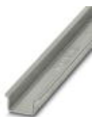
DIN rail, unperforated, Standard profile 2.3 mm, width: 35 mm, height: 15 mm, acc. to EN 60715, material: Steel, galvanized, passivated with a thick layer, length: 2000 mm, color: silver

DIN rail, unperforated - NS 35/15-2,3 UNPERF 2000MM - 1201798