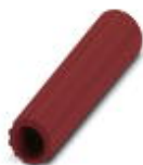
Insulating sleeve, color: red