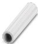
Insulating sleeve, color: white