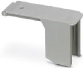
Covering hood, length: 85.6 mm, width: 28.8 mm, height: 46.7 mm, color: gray

Please be informed that the data shown in this PDF Document is generated from our Online Catalog. Please find the complete data in the user's documentation. Our General Terms of Use for Downloads are valid ( http://phoenixcontact.com/download )