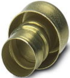
End sleeves as cable protection, made of brass, for WP-STEEL PVC C

Please be informed that the data shown in this PDF Document is generated from our Online Catalog. Please find the complete data in the user's documentation. Our General Terms of Use for Downloads are valid ( http://phoenixcontact.com/download )