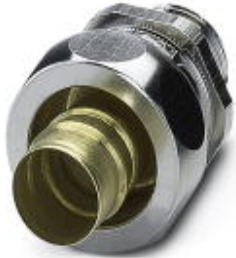
Cable gland made from brass with metric thread, IP65 protection

Please be informed that the data shown in this PDF Document is generated from our Online Catalog. Please find the complete data in the user's documentation. Our General Terms of Use for Downloads are valid ( http://phoenixcontact.com/download )