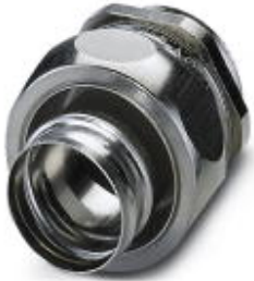
Cable gland made from brass with Pg thread, IP40 protection

Please be informed that the data shown in this PDF Document is generated from our Online Catalog. Please find the complete data in the user's documentation. Our General Terms of Use for Downloads are valid ( http://phoenixcontact.com/download )