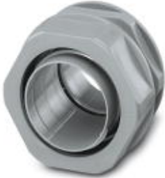
Cable gland made from PP with metric thread, IP65 protection

Please be informed that the data shown in this PDF Document is generated from our Online Catalog. Please find the complete data in the user's documentation. Our General Terms of Use for Downloads are valid ( http://phoenixcontact.com/download )