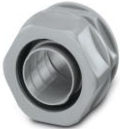
Cable gland made from PP with Pg thread, IP65 protection

Please be informed that the data shown in this PDF Document is generated from our Online Catalog. Please find the complete data in the user's documentation. Our General Terms of Use for Downloads are valid ( http://phoenixcontact.com/download )