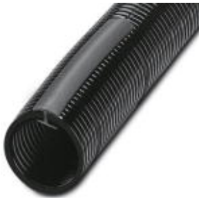
Polyamide protective hose, inflammability class V0, UV resistant

Please be informed that the data shown in this PDF Document is generated from our Online Catalog. Please find the complete data in the user's documentation. Our General Terms of Use for Downloads are valid ( http://phoenixcontact.com/download )