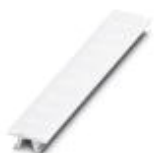
Zack marker strip, Strip, white, labeled, can be labeled with: CMS-P1-PLOTTER, Printed horizontally: Consecutive numbers 1 - 10, 11 - 20, etc. up to 491 - 500, Mounting type: Snap into tall marker groove, for terminal block width: 6.2 mm, Lettering field: 6.15 x 10.5 mm

Zack marker strip - ZB 6,LGS:FORTL.ZAHLEN - 1051016