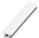
Zack marker strip, can be ordered: Strip, white, labeled according to customer specifications, Mounting type: Snap into tall marker groove, for terminal block width: 6.2 mm, Lettering field: 6.15 x 10.5 mm

Zack marker strip - ZB 6,LGS:FORTL.ZAHLEN - 1051016