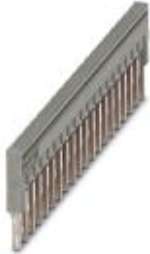
Plug-in bridge, pitch: 3.5 mm, number of positions: 20, color: gray

Please be informed that the data shown in this PDF Document is generated from our Online Catalog. Please find the complete data in the user's documentation. Our General Terms of Use for Downloads are valid ( http://phoenixcontact.com/download )