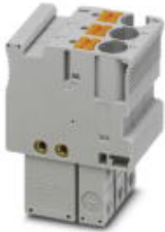
Plug, 3-pos. with integrated, automatic short circuit function

Please be informed that the data shown in this PDF Document is generated from our Online Catalog. Please find the complete data in the user's documentation. Our General Terms of Use for Downloads are valid ( http://phoenixcontact.com/download )