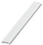
Zack Marker strip, flat, Strip, white, unlabeled, can be labeled with: PLOTMARK, CMS-P1-PLOTTER, mounting type: snap into flat marker groove, for terminal block width: 6.2 mm, lettering field size: 5.15 x 6.15 mm, Number of individual labels: 10

Zack Marker strip, flat - ZBF 6:UNBEDRUCKT - 0808710