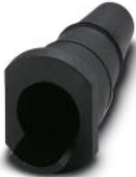
Bend protection sleeve, for cable diameter of 3 mm ... 9 mm, diameter: 12 mm, color: black

Please be informed that the data shown in this PDF Document is generated from our Online Catalog. Please find the complete data in the user's documentation. Our General Terms of Use for Downloads are valid ( http://phoenixcontact.com/download )