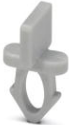
Spacer, 4.5 mm, color: white

Please be informed that the data shown in this PDF Document is generated from our Online Catalog. Please find the complete data in the user's documentation. Our General Terms of Use for Downloads are valid ( http://phoenixcontact.com/download )