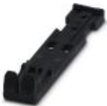
Strain relief, length: 48.7 mm, width: 9.3 mm, number of positions: 2, color: black