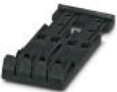
Strain relief, length: 48.7 mm, width: 19.6 mm, number of positions: 4, color: black