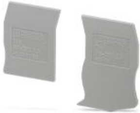
Cover segment, length: 72 mm, height: 36.5 mm, color: gray

Please be informed that the data shown in this PDF Document is generated from our Online Catalog. Please find the complete data in the user's documentation. Our General Terms of Use for Downloads are valid ( http://phoenixcontact.com/download )