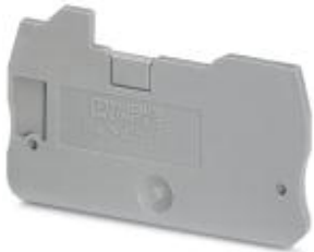
End cover, length: 58.8 mm, width: 2.2 mm, height: 42.8 mm, color: gray

Please be informed that the data shown in this PDF Document is generated from our Online Catalog. Please find the complete data in the user's documentation. Our General Terms of Use for Downloads are valid ( http://phoenixcontact.com/download )