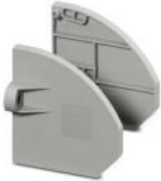
Flange, number of positions: 0, color: gray

Please be informed that the data shown in this PDF Document is generated from our Online Catalog. Please find the complete data in the user's documentation. Our General Terms of Use for Downloads are valid ( http://phoenixcontact.com/download )