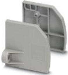
Flange cover, number of positions: 0, color: gray

Please be informed that the data shown in this PDF Document is generated from our Online Catalog. Please find the complete data in the user's documentation. Our General Terms of Use for Downloads are valid ( http://phoenixcontact.com/download )