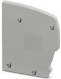
Spacer plate, number of positions: 0, pitch: 0 mm, color: gray

Please be informed that the data shown in this PDF Document is generated from our Online Catalog. Please find the complete data in the user's documentation. Our General Terms of Use for Downloads are valid ( http://phoenixcontact.com/download )